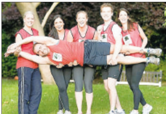
■ The Goldschmidt and Howland running team